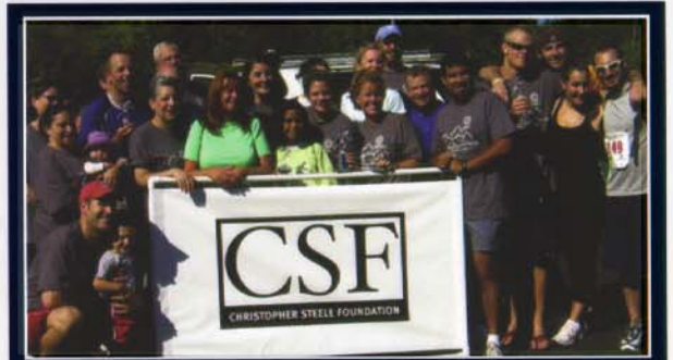
Members of the Christopher Steele Foundation at the Long Grove Heritage Run/Walk in September 2007